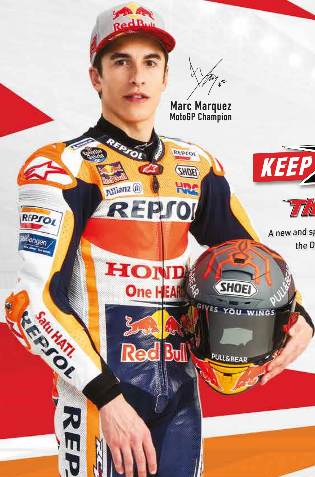
Marc Marquez Marc Marquez MotoGP Champion